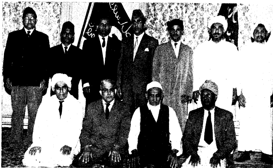
Members of the Management Committee of the South Shields New Mosque Islamic Trust Fund gathered in the temporary Mosque premises.