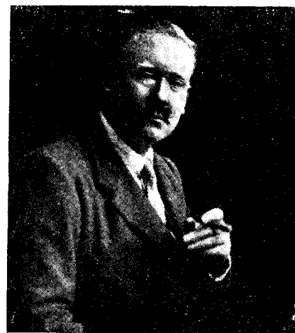
Sir Archibald Hamilton (England).