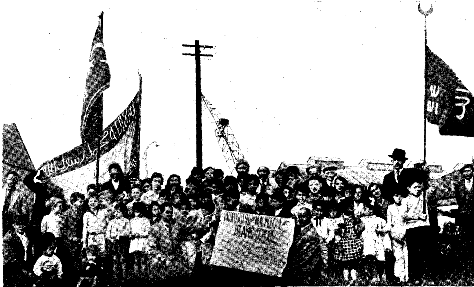
A Group of some of the Muslim children, taken on the site on which the new Mosque and School will be built. The background objects indicate the nearness of the site to the river and the shipyards. Nearby are four modern housing blocks occupied by Muslim families, and there are also Muslim boarding houses and cafés. Other Muslim families live on new Housing Estates on the outskirts of the town.

Since 1943 a room in a former public house was used as a mosque, but, under Town Planning developments, this has now been demolished; but, by the courtesy of the Town Council, permission has been obtained to use an old Municipal Reading Room as a mosque, and the move into these premises has already been made.