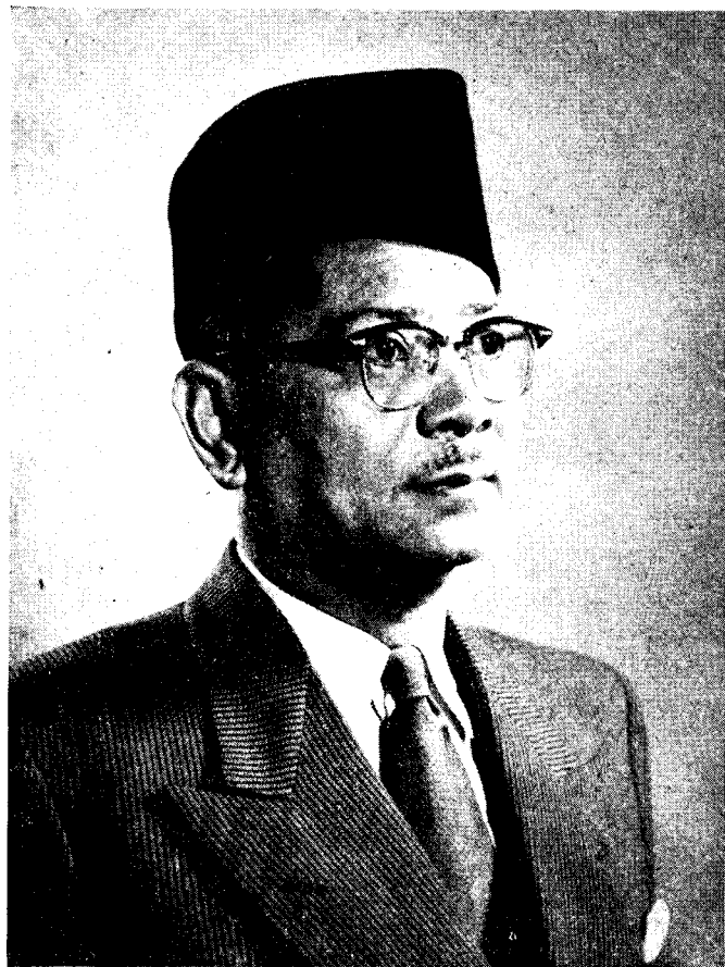
Tunku Abdul Rahman Putra, Prime Minister of Malaya.

The establishment of a special Ministry of Rural Development was the most important announcement made by the Prime Minister, Tunku Abdul Rahman Putra, on assuming office again after the 1959 General Elections.