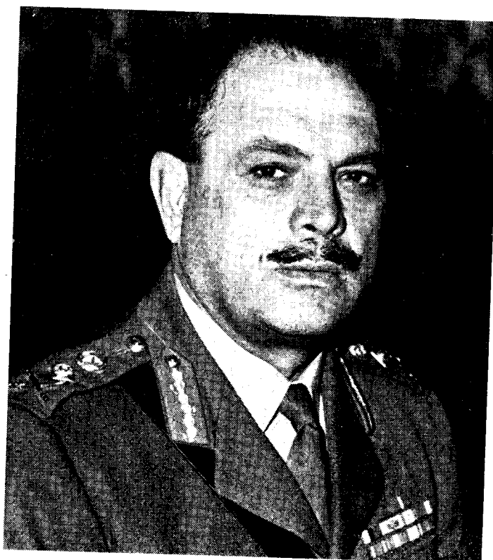
Muhammad Ayub Khan

Two years later, now a General, he returned to England to attend the Imperial General Staff Conference of the Commonwealth. In 1954 he was appointed to the cabinet as the Minister of Defence, from which he resigned in 1956.