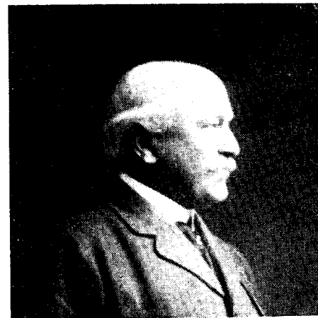
Al-Haji Lord Headley al-Farooq (d. 1935) (England).